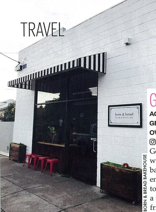
BORN & BREAD BAKEHOUSE