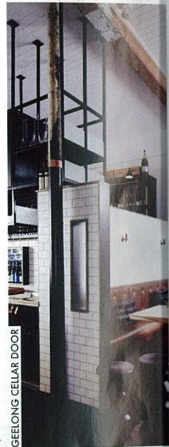
GEELONG CELLAR DOOR