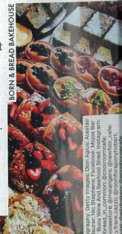
BORN & BREAD BAKEHOUSE