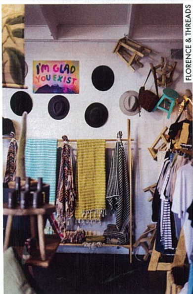
FLORENCE & THREADS